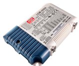
03230 DRIVER 350-1050mA 40W 1..10V IP20